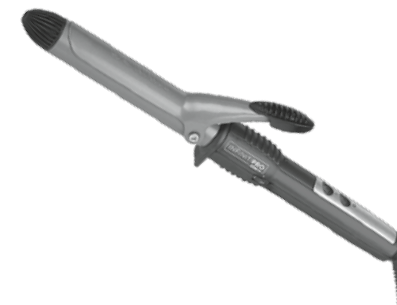
1 in. (25 mm) tourmaline ceramic curling iron